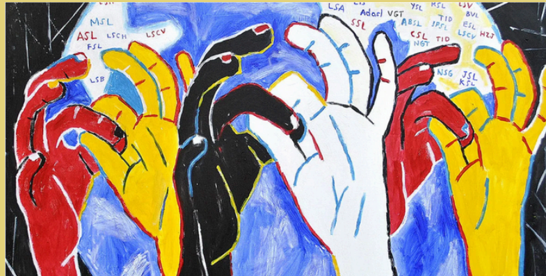
"Deaf people around the world" painting by Nancy Rourke